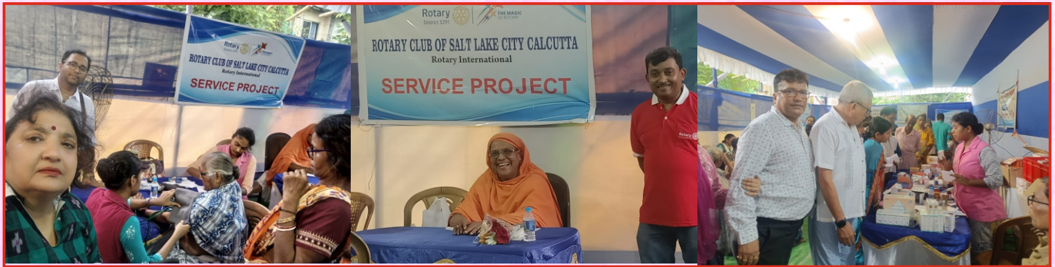
Mega Health Camp for Mother & Child on 27th July 2024 at Jodhpur Park in association with Ramkrishna Sarada Mission Matri Sadan