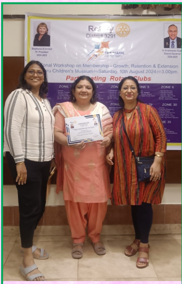
District Membership seminar attended on 10th August 2024