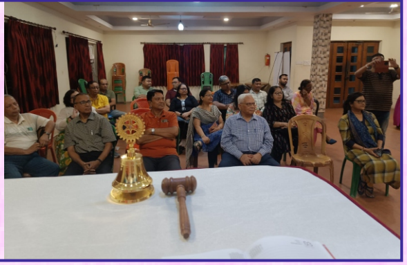
1st RWM of Rotary year 2024-25 on 3rd July 2024