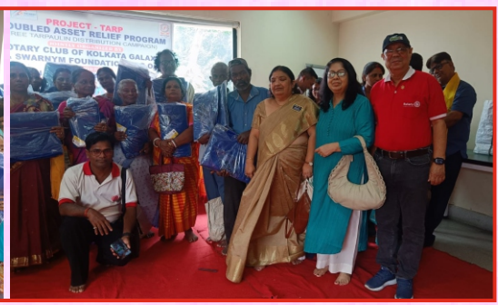
Tarpaulin distribution project on 11th August 2024