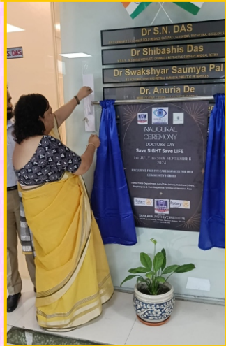
Eye check up camp for daily heroes & family of Rotarians at Sankar Jyoti Eye Institute on 2nd July 2024