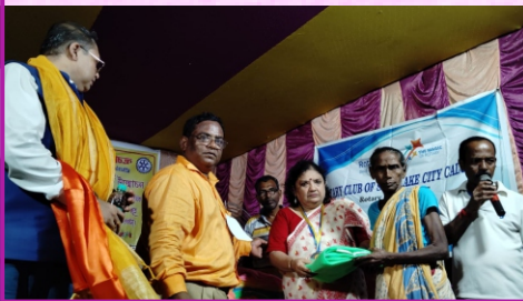
Mosquito Net distribution on 15th August 2024