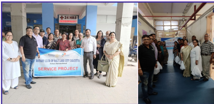
Food Packets distributed to patients of the maternity ward at Bidhannagar Sub Divisional hospital on 1st July 2024