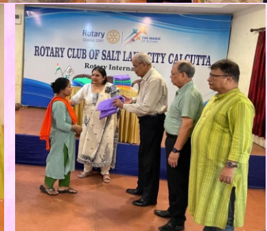
Celebration of Independence Day in Club on 15th August 2024