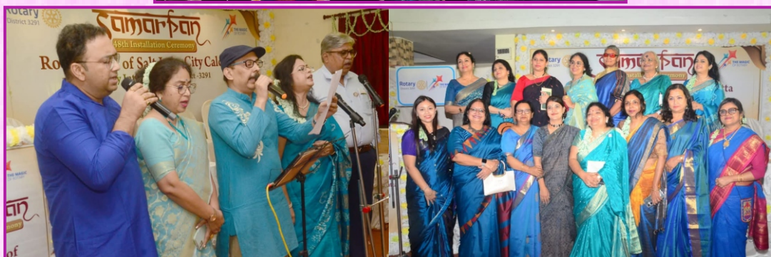
Installation Ceremony of RY 2024-25 on 12th July 2024