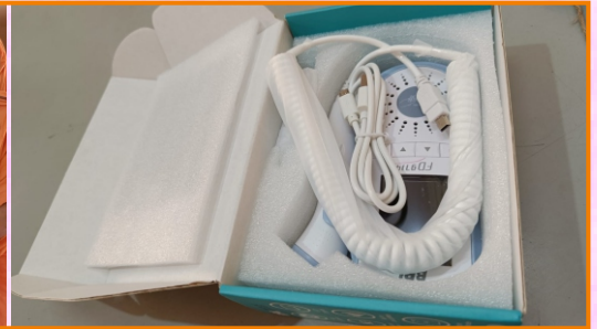
Foetal Doppler donated to RKSM Matri Sadan on 19th August 2024