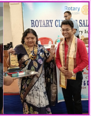
Doctors' Day & Chartered Accountants' Day Celebration