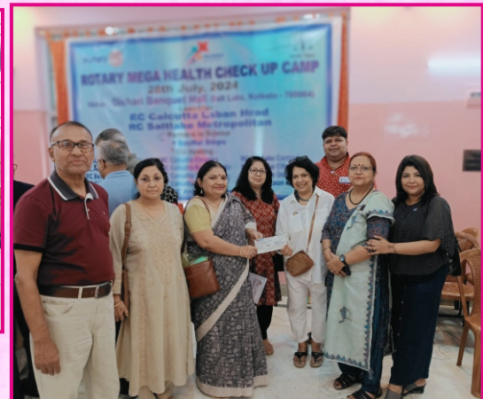
Health check up camp with Rotarian families and underprivileged people with Rotary Club of Laban Hrad